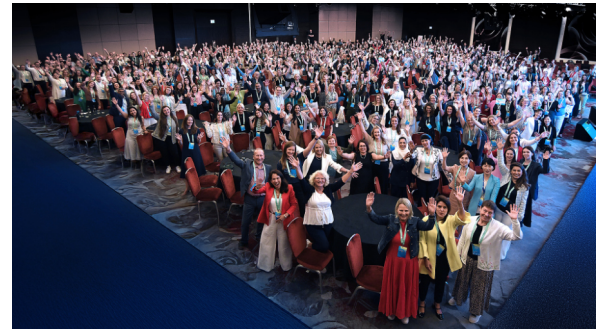
WIN Global Conference UK 14-18 July 2025