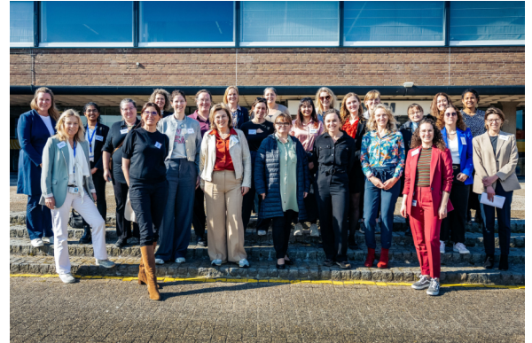
Group photo of the kick-off event.

Be proud to be a professional women working in the nuclear sector and dare to speak up!